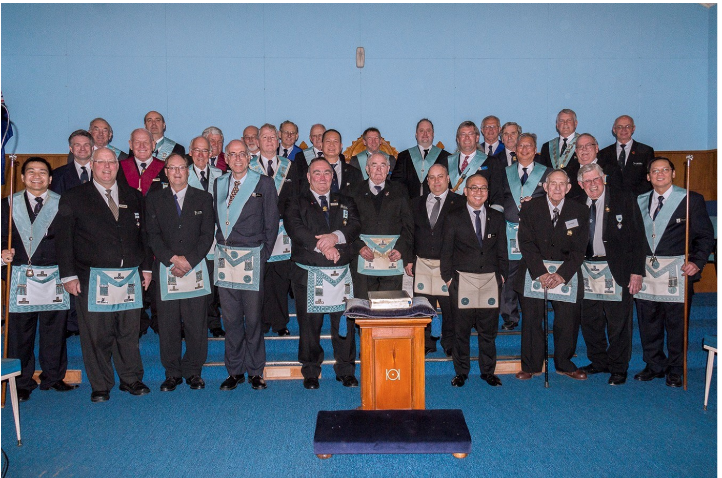
The Assembled Brethren after the Second Degree Ceremony