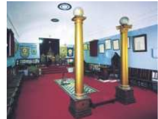
Interior of the Lodge Room in Penryn

-many sources, but see especially: http://www.pglcornwall.org.uk/ http://penryncornwall.com http://en.wikipedia.org/wiki/Penryn