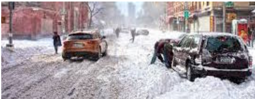
Snowed Out in February 2015