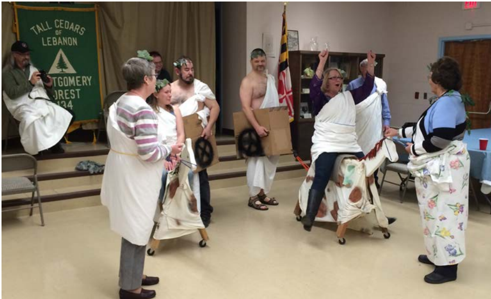
Roman Chariot Racing in January 2015