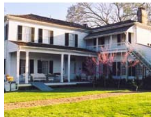
The Back Door

Liendo had always been recognized for its warm Southern hospitality, but few people know that this same tradition of generosity probably saved it from destruction. Among the more notable statesmen and historical figures that have spent time at Liendo was George A. Custer. At the end of the Civil War, he was stationed at Liendo. It is said that both Mr. Custer and his wife were so impressed with the plantation and the gracious hospitality shown them during their stay, that they made sure Liendo was not harmed in appreciation.