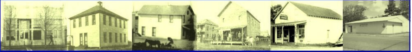
The Waller Masonic Lodge Buildings From December 30, 1897 To The Present