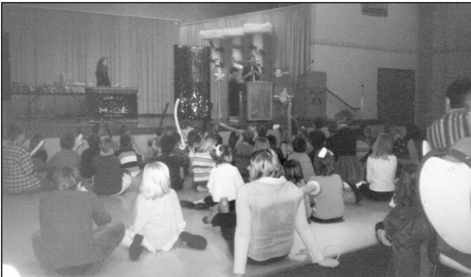
The children all wait for the arrival of Santa Claus.